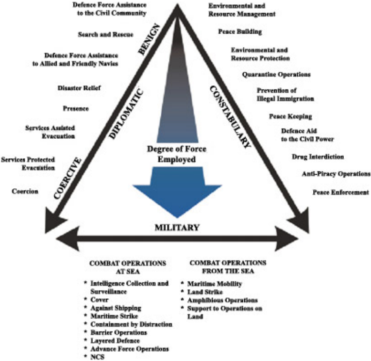
Figure 3: The Booth Model – RAN Version 137

longer timeframe than most other naval doctrine studied). 135 It then provided a detailed discussion of maritime strategic and operational concepts, including sea control, sea denial and command of the sea. In this discussion it drew heavily on many prominent maritime strategic theorists. Although Grove’s typology for navies was not discussed, an overview of maritime operations drew heavily on the Booth model and Grove’s subsequent refinements, and RAN Doctrine 1 itself substantially developed its own derivative of the model (see Figure 3). 136