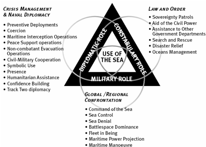
Figure 2: The Booth Model – Canadian Navy Version 104

an impact in the public realm, even though it attracted the occasional criticism. 102 As one retired Canadian navy Lieutenant Commander recalled, Leadmark temporarily gave the navy the edge it required to secure funding for its priorities ahead of the army and air force, precisely because at the time Leadmark was released neither of the other services had an equivalent ‘glossy publication you could give to a politician’. 103