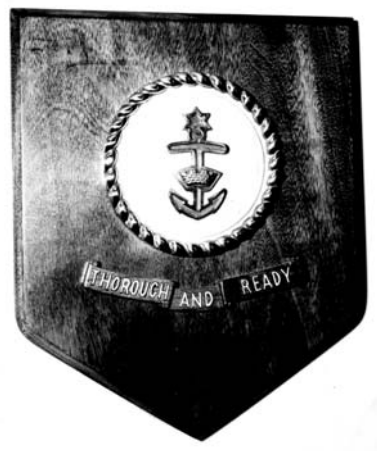
Figure 15 HMAS Sydney III – 1950 badge design with motto scroll

Design 2 – 1950; the second design was approved on 22 August 1950 by the Naval Board with the adoption of a new motto, ‘Thorough and Ready’. The motto of ‘ I Take But I Surrender ’ at that time, was no longer considered appropriate for a warship so the original motto from Sydney I was reinstated. (Figure 15 & 16)