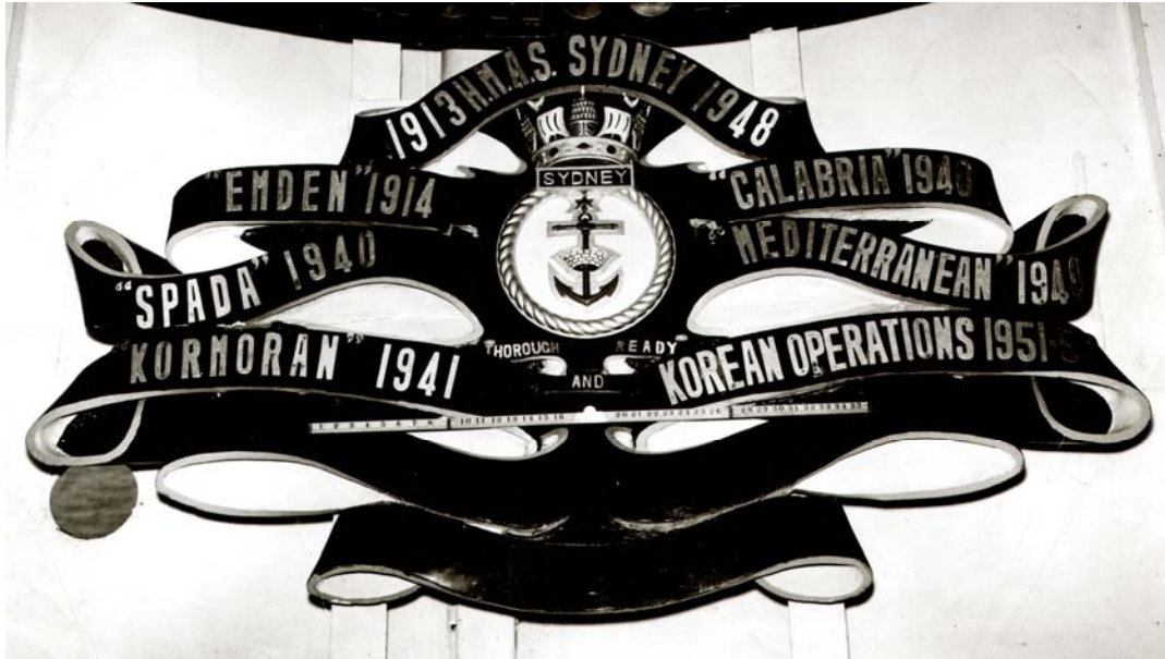
Figure 16 HMAS Sydney III – Battle Honour Board (with 1950 badge design)

During 1948 and 1964 the badge was displayed with and without a Naval Crown (RN) and/or Motto Scroll.