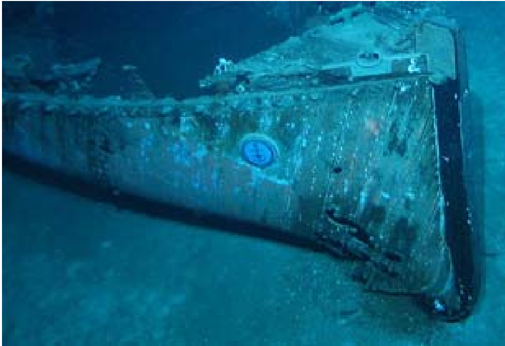
Figure 11 HMAS Sydney II – Ship's Boat (blue badge design)