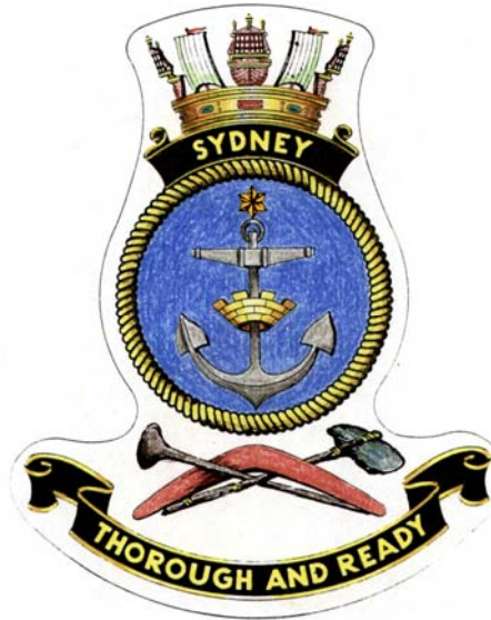
Figure 18 HMAS Sydney III – 1970 badge design

Design 4 – 1970; the design changed again by displaying the star as yellow (Or) to correct the heraldic discrepancy that was stated previously by having the star red (Gules) on a blue (Azure) field. The badge design alteration was officially approved 7 May 1970 by the Ships' Names, Badges and Honours Committee (SNB&HC). (Figure 18)