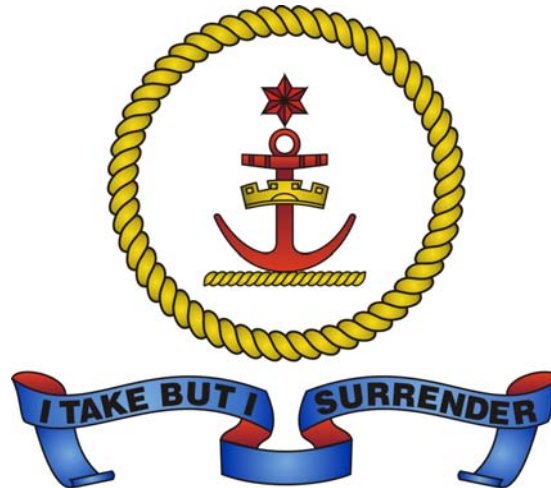
Figure 6 HMAS Sydney II official badge design as approved by the Naval Board 14 March 1935

HMAS Sydney (II) badge was 'as worn' by Sydney I but with the addition of a new motto and scroll. (Figure 6)