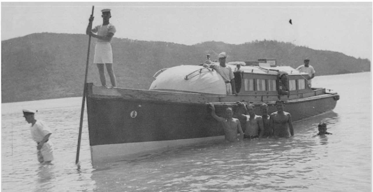
Figure 12 HMAS Sydney II – Motor Boat (boat badge displayed on bow)