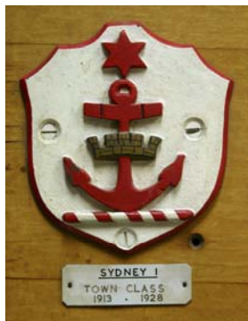
Figure 3 Manufactured at Garden Island Pattern Shop, Sydney

The shield design was displayed to represent the shield (Escutcheon) from the City of Sydney Coat of Arms. Note the incorrect colouring of the crest wreath (silk ribbon) of red (Gules) & white (Argent). The correct colouring should have been yellow (Or) & blue (Azure). Also the number of ribbon twists varies in each design the correct amount displayed should have been six.