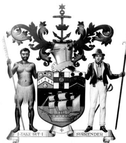
Figure 1 City of Sydney Coat of Arms – granted 30 July 1908

HMAS Sydney (I) badge design was inspired by the crest of the City of Sydney Coat of Arms. (Figure 1)