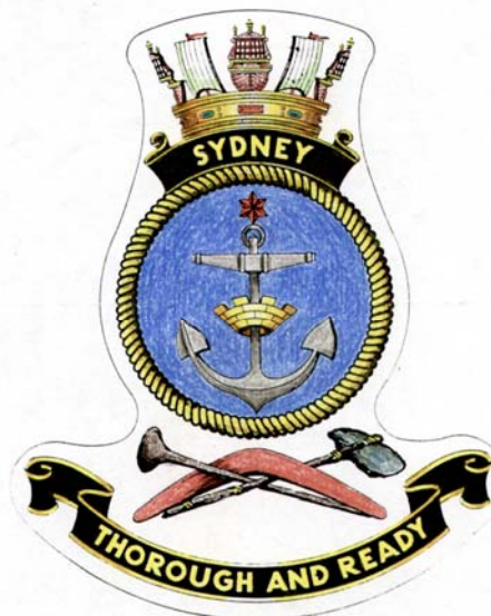
Figure 17 HMAS Sydney III – 1964 badge design

Design 3 – 1964; when it was time to update the badge design into the latest approved standard badge design surround the Registrar proposed the new blazon (heraldic description), Azure; an Admiralty Anchor proper erect, ensigned by a mullet of six points gules and enfiled by a mural crown gold; and for a motto “THOROUGH AND READY.” Though a heraldic tincture rule discrepancy had been raised with the new blazon and design it was suggested that as long as the star touched the top of the anchor ring no breach was committed. The badge was drawn up accordingly and then officially approved 11 May 1964 by the Chairman of the SNB&HC, DCNP. (Figure 17)