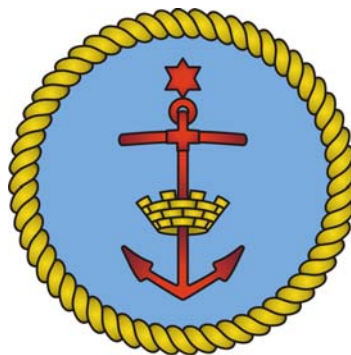
Figure 10 HMAS Sydney II badge design (blue field)

With the 2008 discovery of HMAS Sydney II off the coast of Western Australia the 'as worn' boat badge (figure 11) displaying a blue field can be clearly seen. It is not known why her badges displayed a blue field but some advice from the naval board and badge manufactures may have been misunderstood or lost in translation between approval and badge manufacture by the pattern makers. It is apparent that HMAS Sydney II displayed two different field colourings during her service. It is not known if both were displayed concurrently or whether the blue replaced the white field on advice from a higher authority.