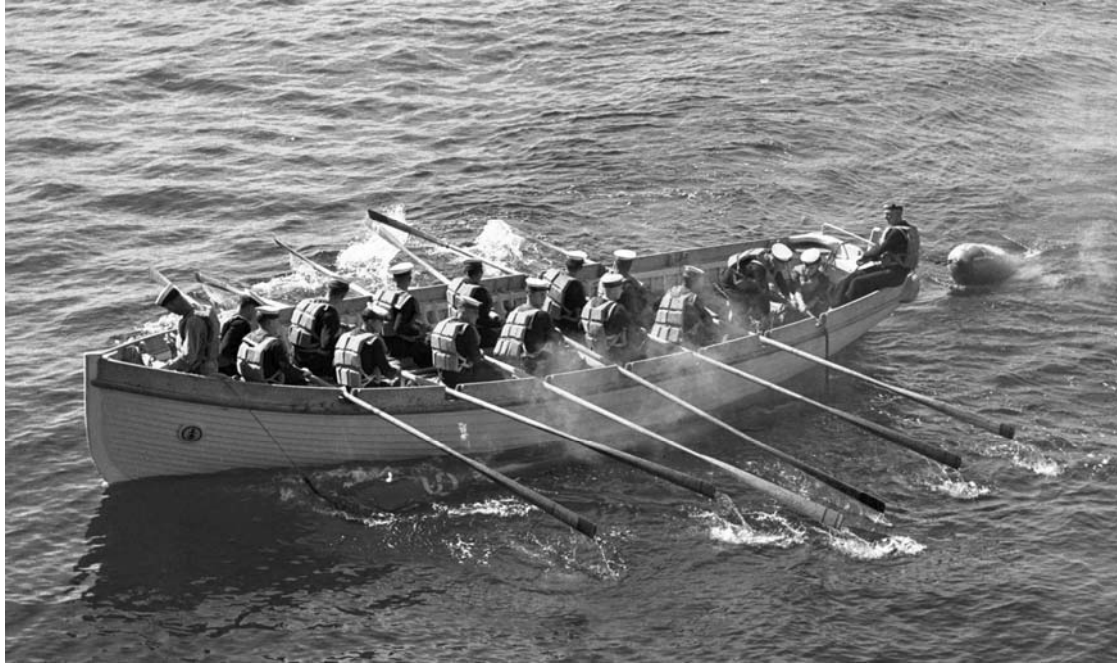
Figure 13 HMAS Sydney II – Cutter ( boat badge displayed on bow)