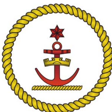
Figure 2 HMAS Sydney I badge design

The original artist of the design did take some liberties though in the representation of the crest – the crown should have been a mural crown (as though built of masonry) and the crest wreath appears to have been stylized into a length of rope hawser instead of representing two lengths of silk ribbon twisted together. (Figure 2)