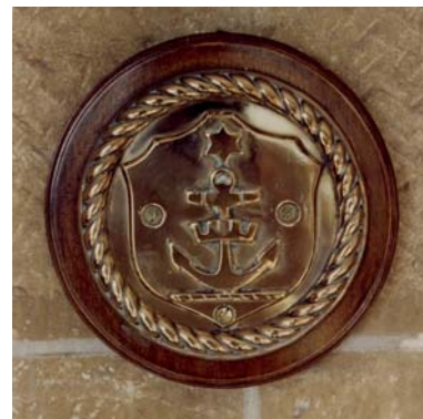
Figure 4 Garden Island, Sydney