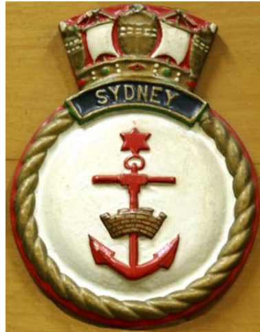
Figure 14 HMAS Sydney III – 1948 badge design with RN Naval Crown

Design 1 - as worn by Sydney II but with the addition of the RN naval crown and ships name scroll. (Figure 11)