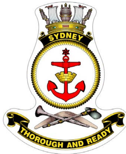
Figure 20 HMAS Sydney IV – 1979 badge design

HMAS Sydney (IV) as displayed by Sydney III design but had the Mural Crown slightly modified in its representation and placed into the 1975 (current) approved standard badge design surround. (Figure 20)