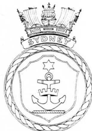
Figure 5 Line Drawing Garden Island Pattern Shop, Sydney