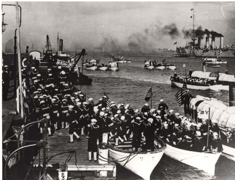
SAILORS FROM THE GREAT WHITE FLEET COME ASHORE IN MELBOURNE