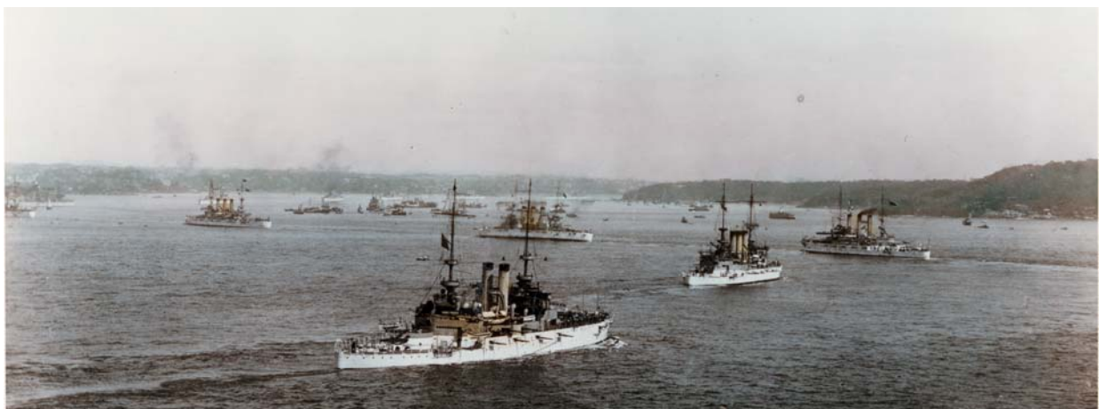
THE GREAT WHITE FLEET ENTERS SYDNEY HARBOUR 20 AUGUST 1908