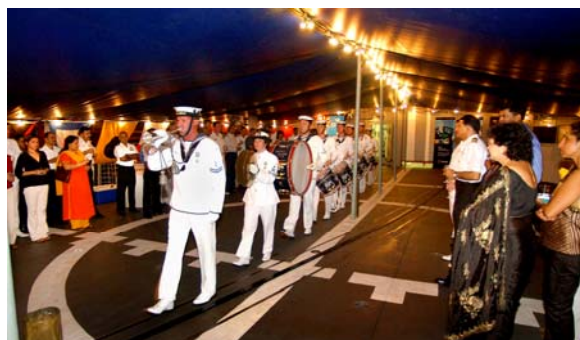
BEAT TO QUARTERS ONBOARD HMAS ANZAC IN GOA 2005

The success of the band's second deployment to the MEAO during Christmas 2005 and the New Year 2006, also sponsored by FACE, should not be understated. The 19 strong contingent comprising members from the Sydney and Melbourne detachments, Defence Force School of Music and the Directorate of Music, completed 25 performances over a 16 day period in eight separate locations moving more than three and a half tonnes of equipment for each performance: this was in addition to four days of in theatre military training. There were twelve major concerts in the company of civilian artists, and performance lengths ranged from one and a half hours to three hours. The entire program was performed from memory with a high level of choreography. An additional three and a half hours were required for the set up and pack down. Once again, the reputation of Navy's musicians flew high. The band returned to the Solomon Island in 2007 for a second tour and to the MEAO in 2008 for its third tour; this time travelling within Afghanistan as well as throughout Iraq: again, Navy's musicians performed magnificently.