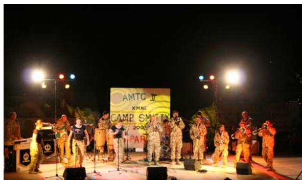
CHRISTMAS EVE CONCERT AT CAMP SMITTY IRAQ 2005

sponsored by the Forces Advisory Council for Entertainment (FACE) and was a resounding success. The highlight of the deployment was a concert in Honiara in front of more than 20,000 people. The band contingent comprised musicians from the Melbourne and Sydney detachments and presented a high energy program performed entirely from memory.