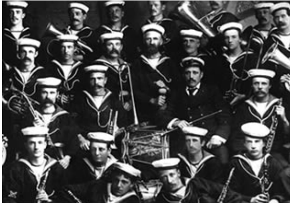
MEMBERS OF THE VICTORIAN NAVAL BRIGADE BAND THAT DEPLOYED TO CHINA AS PART OF THE NAVAL CONTINGENT THAT ASSISTED IN QUELLING THE BOXER UPRISING

A second band was formed in 1927 for Flinders Naval Depot (now HMAS Cerberus ). This band consisted of permanent musicians assisted by volunteers from all branches within the depot. By the late 1930's, in addition to bands in shore establishments, there was a rapid expansion in musician recruitment with a total of five bands at sea, serving in the cruisers Australia , Canberra , Hobart , Perth and Sydney .