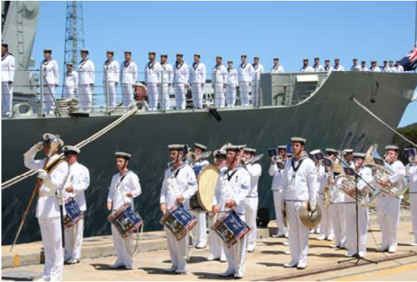
SOUTH AND WESTERN AUSTRALIAN DETACHMENT MEMBERS ON PARADE FOR HMAS CANBERRA DECOMMISSIONING CEREMONY

Of the 106 members of its permanent component, the band has 45 musicians entitled to wear the Australian Active Service Medal: 12 of whom also wear the Iraq campaign medal. Furthermore, a high percentage of its people have served at sea and the band continues to provide a very impressive output for Navy at home and abroad.