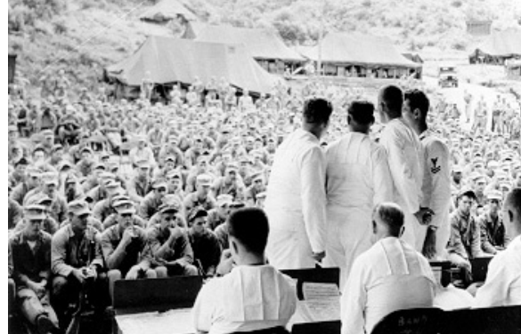
'THE ANCHORS' PERFORM FOR TROOPS IN KOREA ON A 1952 TOUR

competition scheduled for December 13. The USS PENNSYLVANIA band was the winner that evening.