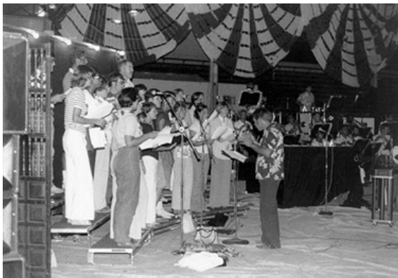
PACIFIC FLEET BAND AND CHORALE

From 1959 to 1969 the band travelled extensively representing the Commander in Chief, U.S. Pacific Fleet throughout the Pacific. During these years the band performed engagements in Pusan and Seoul, South Korea, Guam, the Philippines and Okinawa. Also, in 1960 and 1963, the band, combined with the Barber's Point Naval Air Station Band (which closed in 1965), travelled to the South Pacific for festivities surrounding the "Battle of the Coral Sea Commemoration Celebration." This trip was made once every three years, rotating with the Hickam Air Force Base Band and the Schofield Barracks Army Band. Ports of call for band performances on these trips included Melbourne, Perth and Sydney, Australia, as well as New Zealand, New Caledonia and American Samoa.