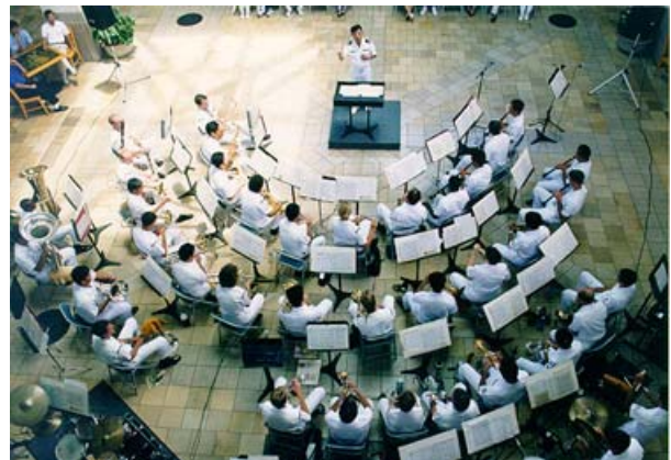
PERFORMING WITH THE JAPANESE MILITARY SELF DEFENSE FORCE BAND AT ALOHA TOWER CIRCA 1995

Today, the Pacific Fleet Band is an organization comprised of highly skilled and versatile Navy professionals dedicated to representing the Commander, U.S. Pacific Fleet throughout the Pacific region. The pride and professionalism that has become synonymous with the Pacific Fleet Band is a large part of the traditions, past, present and future, of the United States Navy.