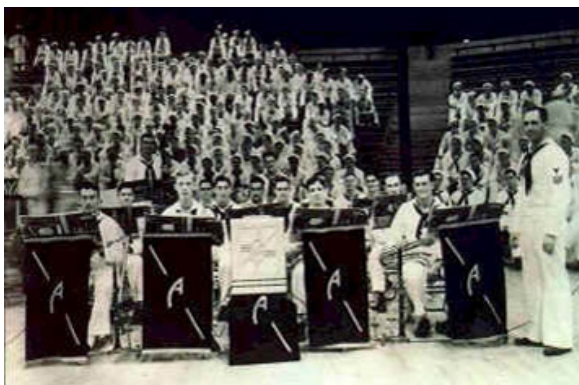
UNIT 22 BAND OF THE USS ARIZONA

The most recognized and highly decorated Navy Band associated with Hawaii was Unit Band 22. This was the band stationed onboard the USS ARIZONA (BB 39) at the time of the Japanese attack on Pearl Harbor, December 7, 1941.