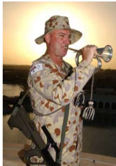
NAVY BUGLER AT THE 2004 ANZAC DAWN SERVICE IN BAGHDAD IRAQ

The Royal Australian Navy Band has performed on the shores of Gallipoli and in the bunkers of Vietnam, throughout Iraq, Afghanistan and the Middle East, at the Royal Tournament and in Disneyland, at the Popes summer palace (Castel Gandolfo) and in the "Big Egg" Stadium in Japan. It supports Navy's regional engagement profile overseas whilst continuing to maintain a strong commitment schedule across Australia. These performances, throughout Australia and the four corners of the world have created the proud traditions upheld by Navy's current generation of musicians, and have established the Royal Australian Navy Band as 'one of Australia's premier military ensembles'.