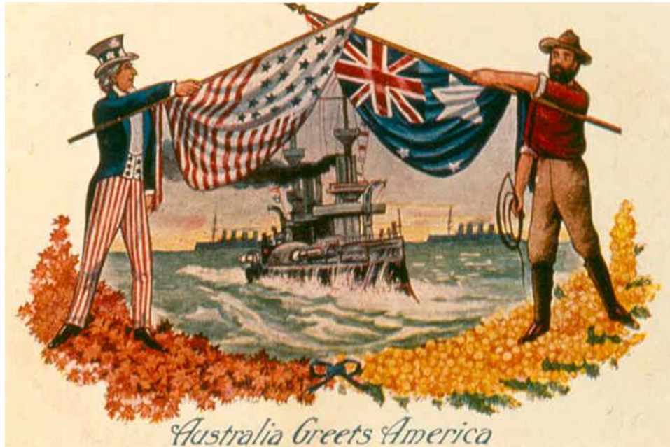
A POSTCARD FROM THE PERIOD