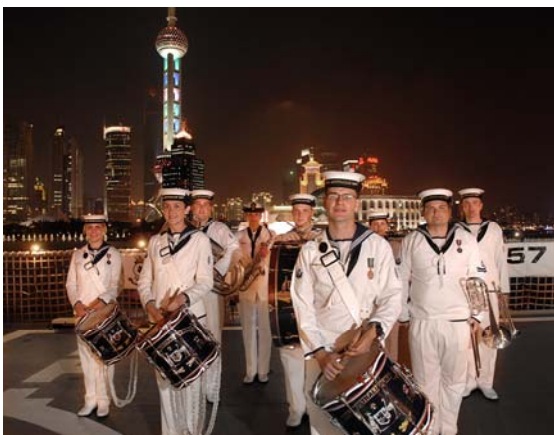
NAVY BAND EMBARKED IN HMAS PARRAMATTA, SHANGHAI, 2007