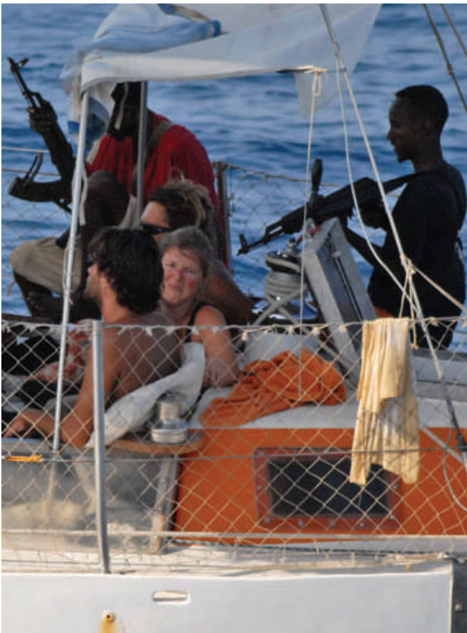
Tanit, April 2009. One of the hostages was subsequently found dead after the yacht was liberated by the French Navy.