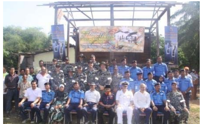
Group photo after clean-up, prior to rebuild

that whilst spicier than many were accustomed to, proved to be a huge hit.