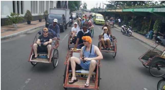
Those fine young Samaritans in animal hats

To Indonesians, Surabaya is known as the city of heroes. Some say its due to the importance of the battle of Surabaya in galvanising Indonesian Independence, other say its because of six members of HMAS Ballarat who saved a young ladies car which had wound up precariously perched on the precipice of disaster (about a metre high ledge). With budgie smugglers well and truly hidden under suitable attire, and not a second thought, the band of brothers heaved the car back to safety to the roaring applause of onlookers. Some will tell you it was just a Nissan Micra, but whatever it was, I'll tell you right now that the only reason it is still driving today is due to the humanitarian super human efforts of those fine young men in animal hats.