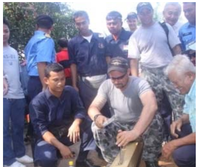
The Buffer takes charge of the chiselling on the main post

It was unfortunate that only a little over half of the roofing was repaired before the afternoon monsoonal rains arrived causing the cessation of work for the remainder