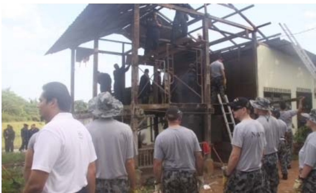
Work begun, with walls and half the roof removed

On Saturday the 23rd of April, members of Ballarat's Ships Company volunteered to assist Royal Malaysian Navy (RMN) personnel as part of their community outreach program. The aim of project was to help make repairs and commence restoration to the wooden parts of a house, as well as clean up the surrounding area.