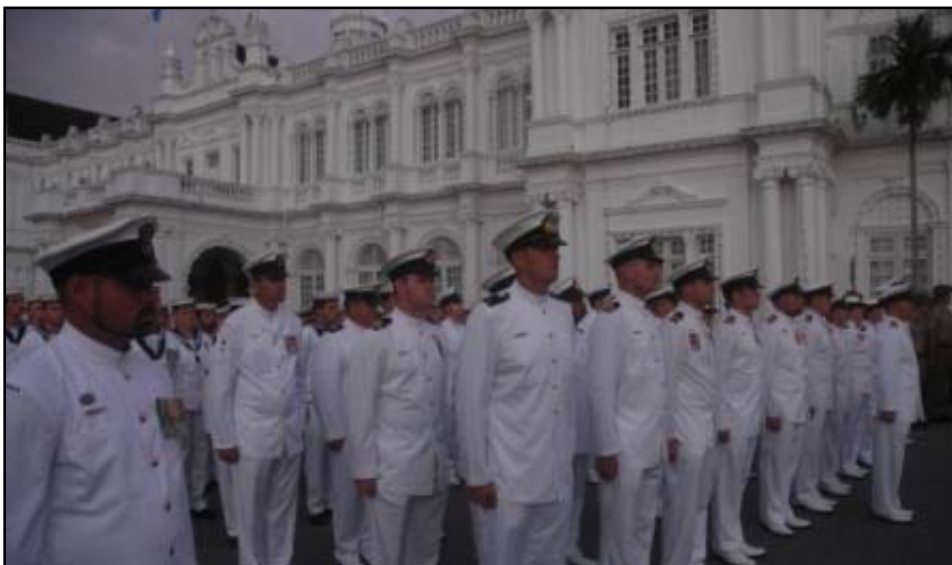
(Left): Ballarat personnel on parade at the ANZAC Dawn Service.

After the Service was completed personnel were invited back to the 'Hostie'; the Australian All Ranks Club in Penang for a traditional gunfire breakfast. The hospitality displayed by local Australian, New Zealand and Malaysian military personnel was a true representation of mateship, and a fitting tribute to the Anzac spirit.