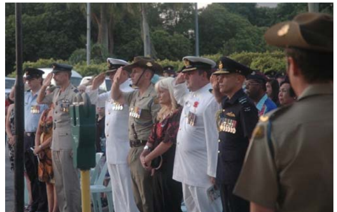
Senior Australian and Allied Defence Force personnel

Malaysia has long been an Australian ally in times of war and peace. Both nations are members of the Five Power Defence Arrangements (FPDA) that exist between Australia, Malaysia, Singapore, New Zealand and the United Kingdom. FPDA is part of a regional security initiative that has been in place for nearly 40 years. This visit was a lead up to Ballarat's involvement in exercise Mastex and Bersama Shield; joint military exercises held between the five countries to help maintain local security and strengthen the bonds between our nations that go back World War II.