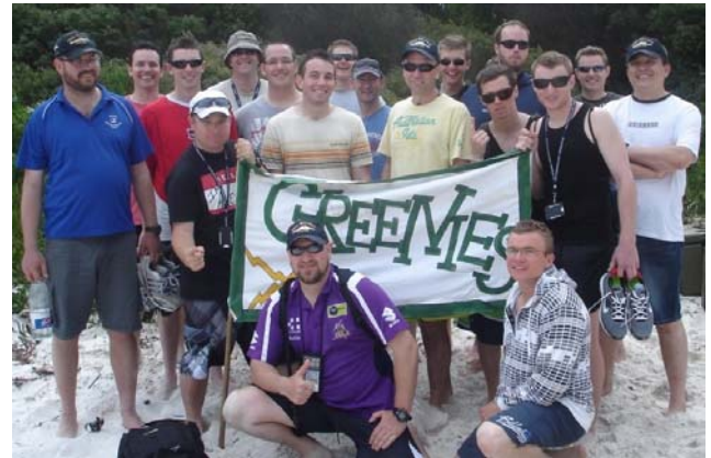
To the victors go the spoils.

[Editor's Note: Theories concerning the Stokers using hallucinogenic sunscreen have since proven untrue.]