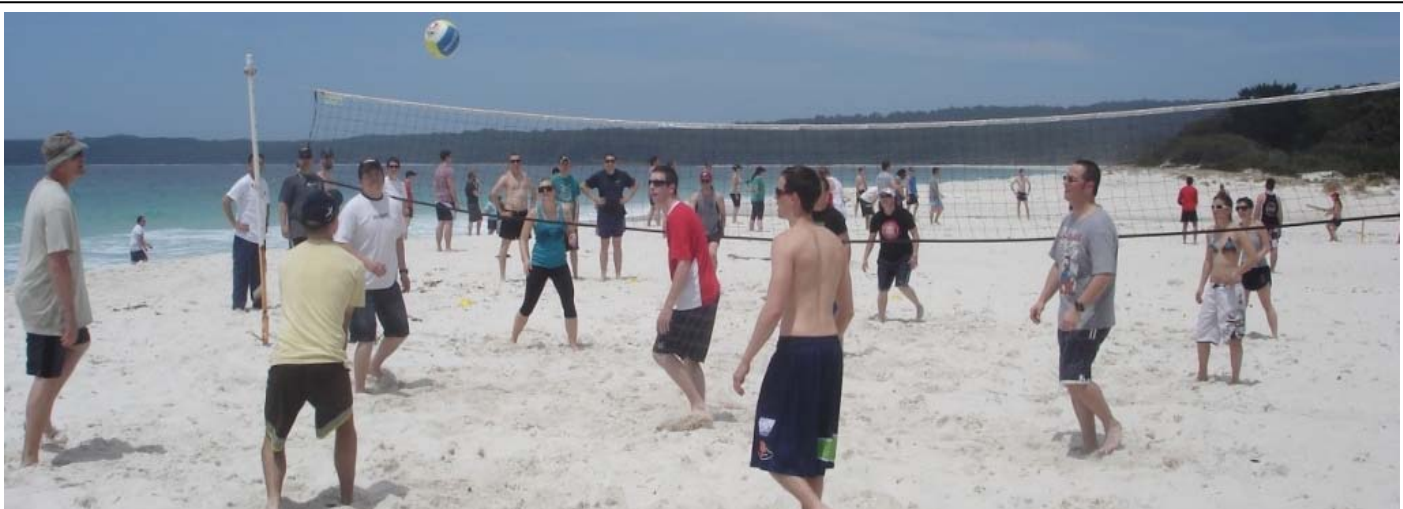
Foreground: Greenies Vs. Supply in Beach Volleyball. Background: Stokers Vs. Executive in Beach Cricket.