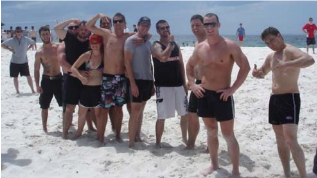
Too pretty to win!

Some members of ship's company were later overheard claiming that the ET's had an unfair advantage; they believed that the extreme energy levels observed from the ET's were due to the large amounts of sleep they had enjoyed through the week.