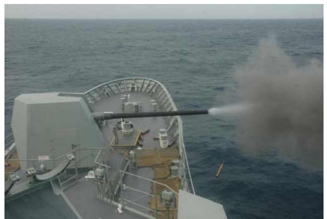
5" Shoot from the Starboard Bridge Wing