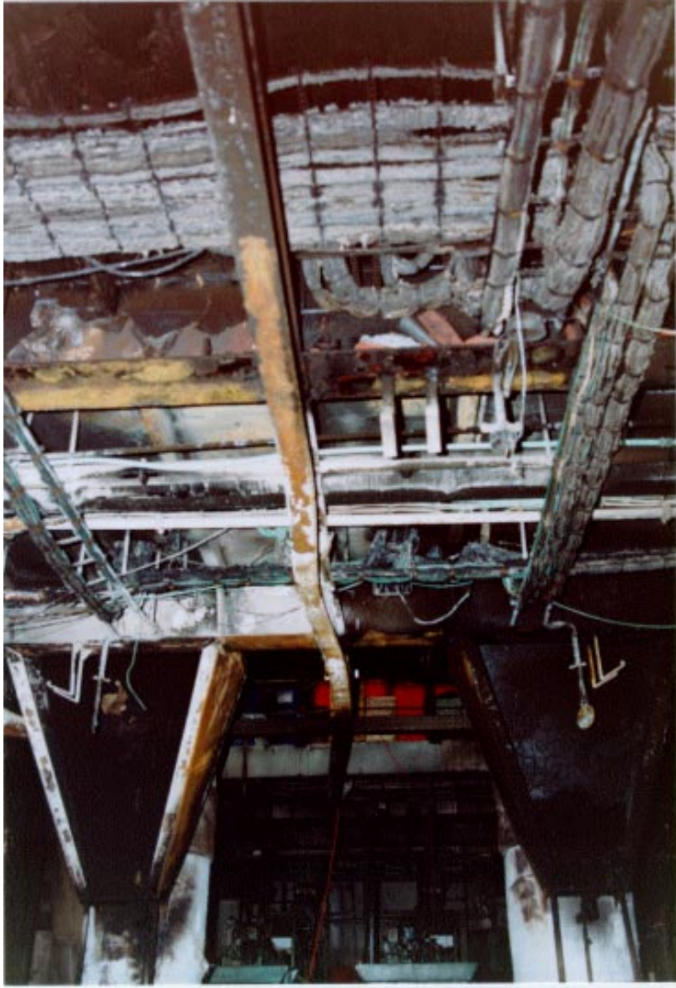
Figure 1. Fire damaged cabling above the main engines (underneath the machinery control room)

14. The starboard main engine was shut down and electrical power to the main machinery space isolated. The emergency generator started automatically. The machinery control room was evacuated at 1038. One minute later, the Engineering Officer recommended to the Commanding Officer that the main machinery space be drenched with carbon dioxide (CO 2 ). One person was thought to still be in the machinery space and the recommendation was not accepted at that time.