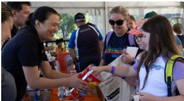
Defence Member and Family Support