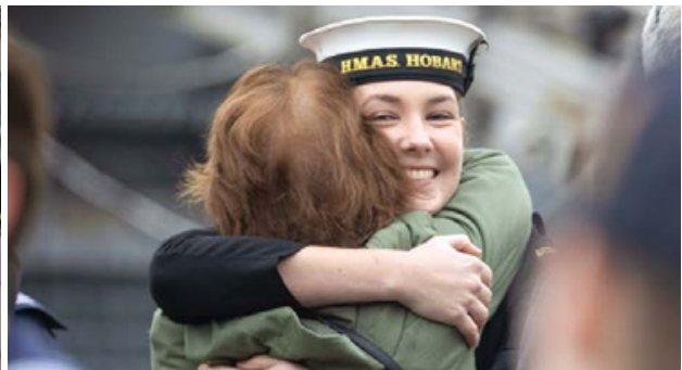
Navy Family Support