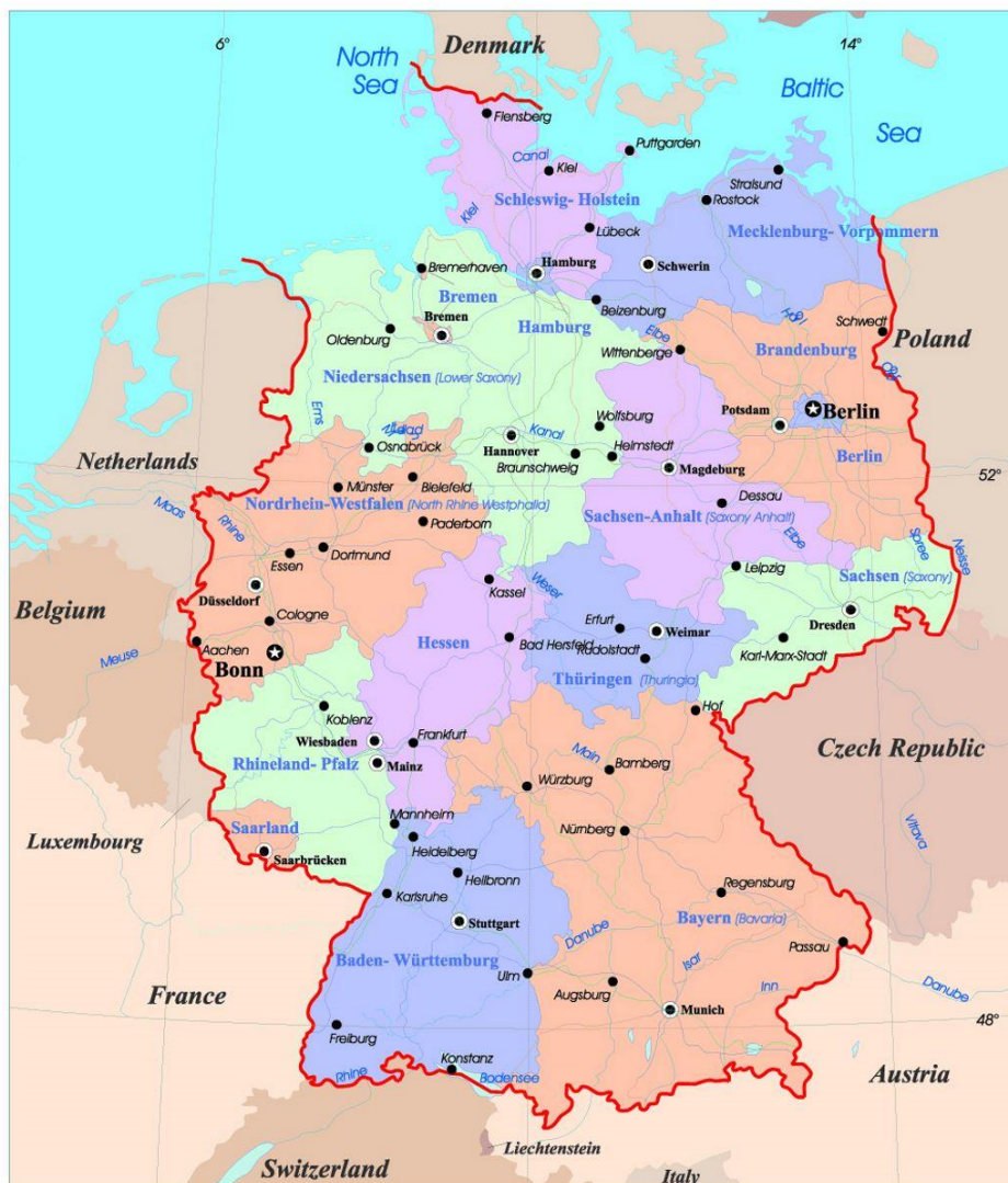
Figure 2: Administrational map of Germany, Mapsland 2022

At the global level, the Federal Republic of Germany is a medium-sized country, both geographically and demographically. 33 Located in Central Europe it essentially enjoys some of the best geography (in economic terms) and worst of geography (in military terms) all at once. Germany is bordered by Poland, the Czech Republic, Austria, Switzerland, France, Luxembourg, Belgium, the Netherlands, and Denmark.