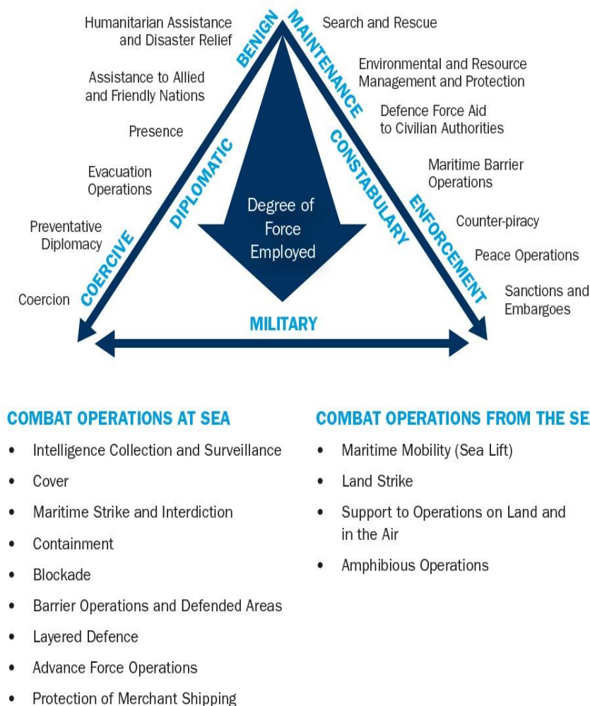
Figure 3: The Span of Maritime Tasks, Australian Maritime Operations

its largest peacetime expansion and the improvements of the ADF's amphibious, strategic lift and offshore sustainment capabilities seen in the last decade.