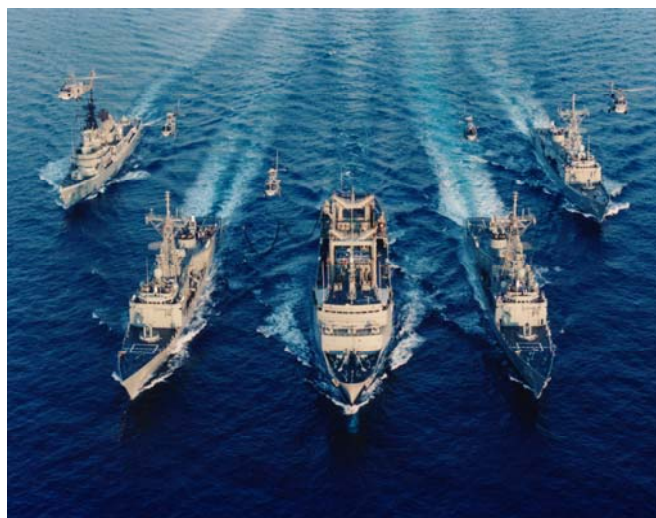
HMA Ships Brisbane, Adelaide, Success, Darwin and Sydney rendezvous for a handover in the Gulf of Oman during Operation DAMASK 1, December 1990.

Not only does 2015 mark the 50 th anniversary of the Vietnam commitment but also the 25 th anniversary of the RAN commitment to the Gulf War (1990-91) and the liberation of Kuwait under the auspices of Operation DAMASK 1.