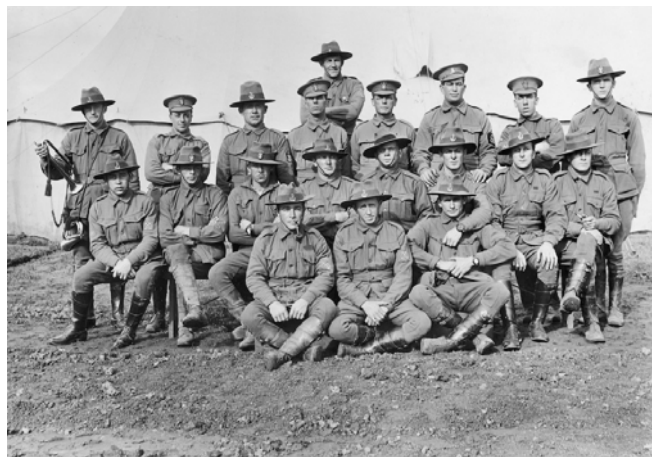
Ratings of the 1 st RANBT at Domain Camp, Melbourne, 1915, prior to embarking for overseas service

Also at Gallipoli was the 1 st Royal Australian Naval Bridging Train (1 st RANBT), formed under the command of Lieutenant Commander LS Bracegirdle, RN, as a mobile naval engineering unit equipped to build pontoons and bridges in support of the military. The initial concept was that it would serve on the battlefields of the Western Front in much the same manner as the engineering elements of the Royal Navy Division. The term 'train', was a direct reference to the horse-drawn wagons that would, in theory, form and move 'in train' to carry the unit's heavy lumber, building supplies and equipment. Many of the ratings serving in the 1 st RANBT were designated 'drivers' and again this refers to wagon drivers.