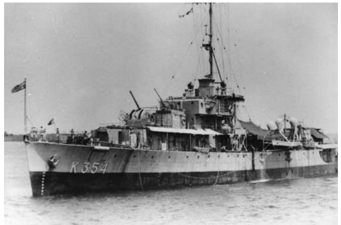
HMAS Gascoyne was one of numerous RAN ships to fight in the Pacific theatre

July 1945 also saw the River class frigate Gascoyne (I) carry out the last naval bombardments in the Balikpapan area. On 26 July, in support of a military force designated BUCKFORCE, Gascoyne proceeded up the Balikpapan River, engaging three separate Japanese held targets as well as landing a military patrol to inspect the village of Mentawir. This action proved to be Gascoyne's last in the war against Japan.