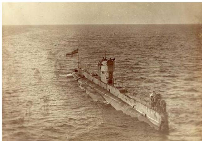
The Australian submarine AE2